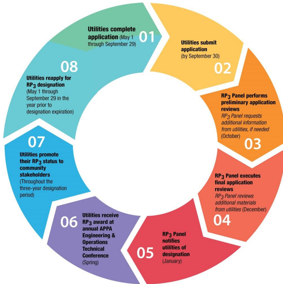
Figure 1: Application cycle